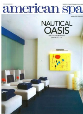
AMERICAN SPA November 2011 Circulation: 28,151